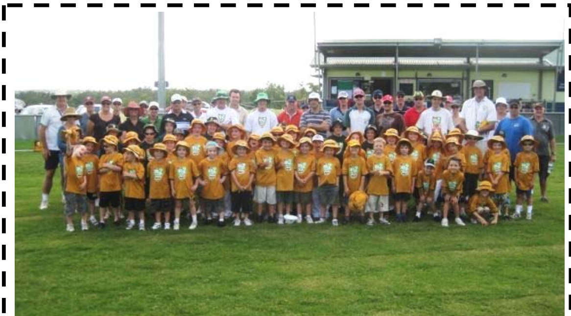
Australia's cricket future is in good hands- Ferny's In2Cricket squad for 2009/2010 on parade - outside the Clubhouse