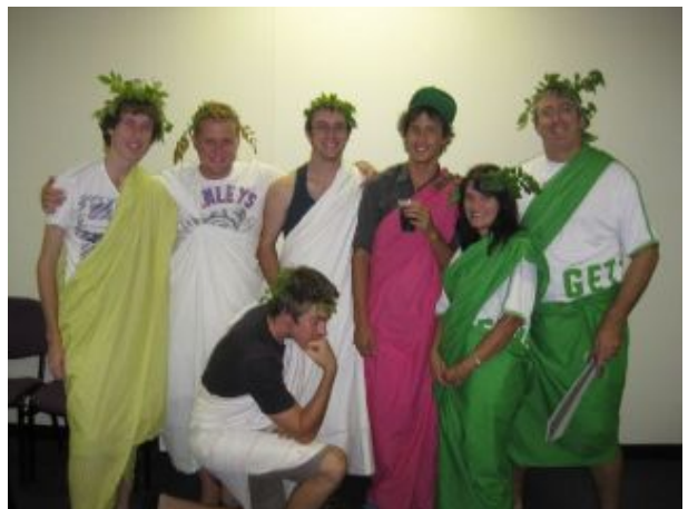
The Ferry Fireballs Warehouse team -at the Italian themed Trivia Night in March 2010 - The Toga Team